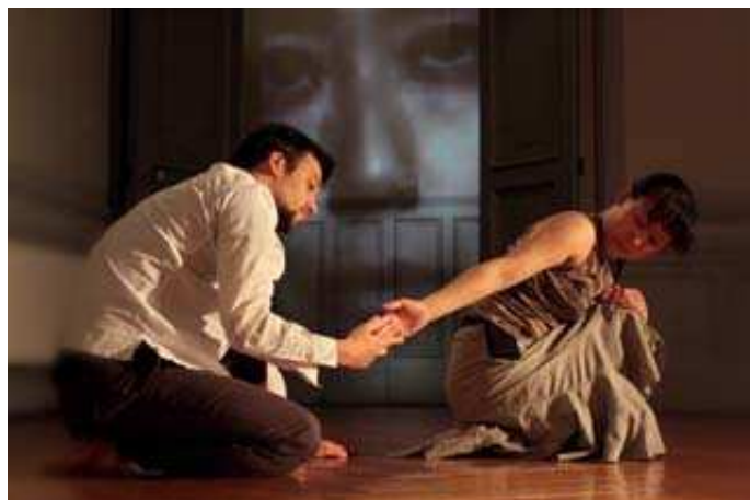
Version Galerie d'Art