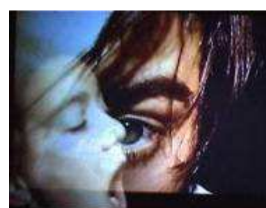
Danse et Toile